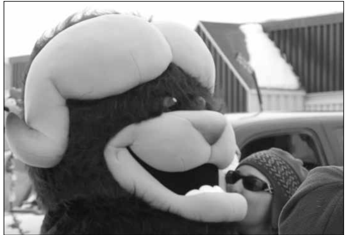
Photo with Ollie the Omingmak Mascot and Family Pictures

Teens are invited to come out and watch a special screening of Avatar at the Luke Novoligak Community Hall. A canteen will be provided.